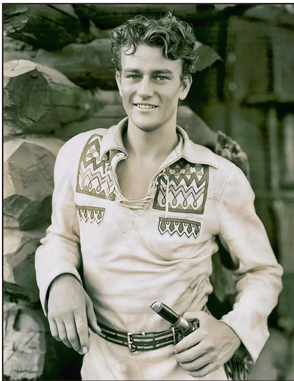
I bet you didn't know Wayne ever looked like that

people don't want to sully him. The third possibility is that he is exponentially more powerful than even some like Tom Cruise, and can control the media to a far greater extent. I don't know any more than you do, but I would guess it is a combination of all three. Nicholson is like the John Wayne of his time: an obvious gay who no one wants to be gay, so he isn't.