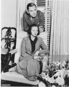
Sidney & Cerf

Sorry, your search returned zero results for "sylvia sidney and family" Sorry, your search returned zero results for "sylvia sidney and jacob" Sorry, your search returned zero results for "sylvia sidney and child"